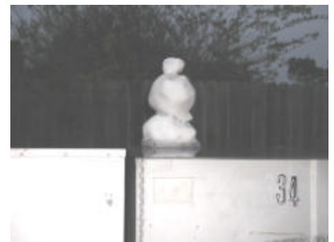
On February 8, 2003, enough snow fell in Austin to build a 6" snowman!